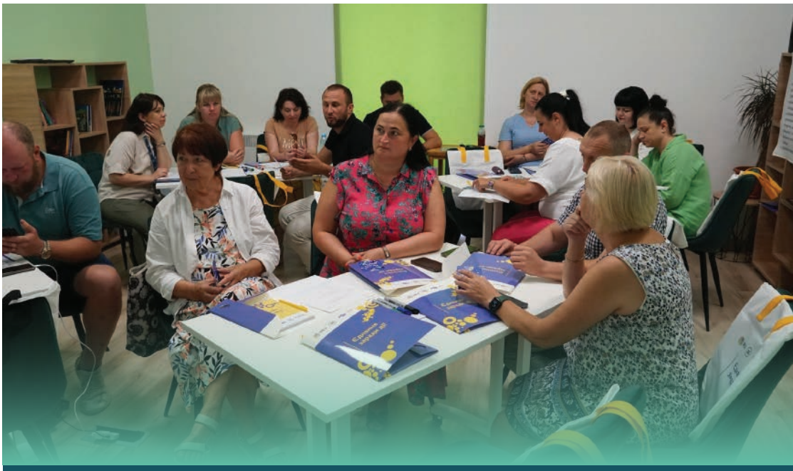
Strategic planning sessions

Strategic planning sessions are organized for the newly established advisory bodies using a dedicated program methodology aimed at IDP Councils and involving expert facilitators.