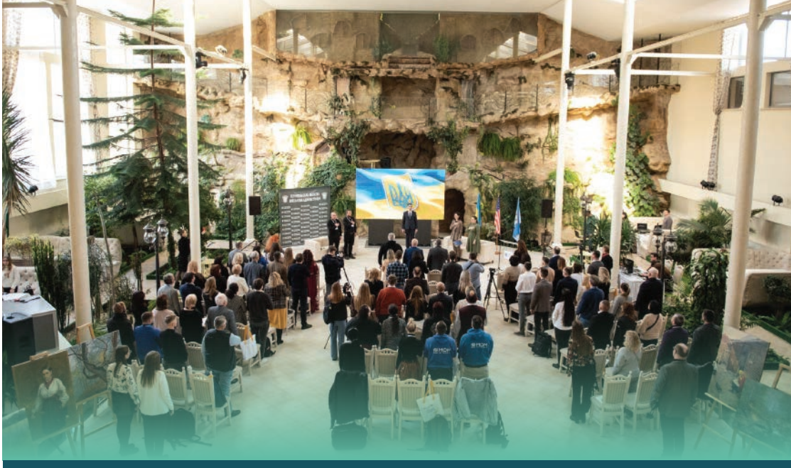
Regional forum "Integration of Internally Displaced Persons in Ternopil'ska Oblast: Effective Tools and the Role of the IDP Council", March 17, 2023.