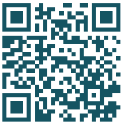
map of the Soviets of the IDPs

All activities are aimed at supporting and developing IDP Councils.